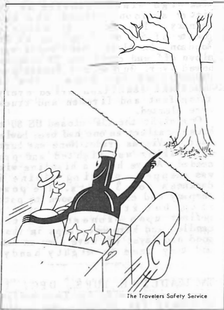
Horsepower and Liquor—A Deadly Combination.

The CHP repeats its warning that driving after sunset with small parking lights is illegal and dangerous. Also be sure to lower the bright beam when approaching cars, from 500 feet ahead or 200 feet following.